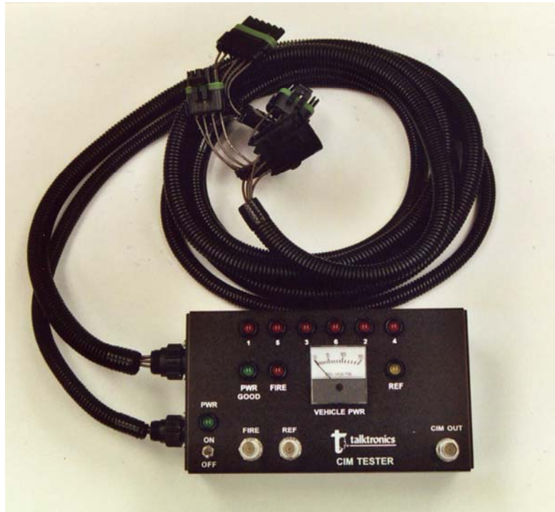
CIM-2000 kit comes with cables as shown

BY PREVENTING MIS-DIAGNOSIS OF ICM FAILURE, THE CIM TESTER PAYS FOR ITSELF WITH ONE USE